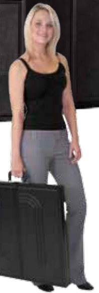
VY 1 WEIGHS 5 LBS