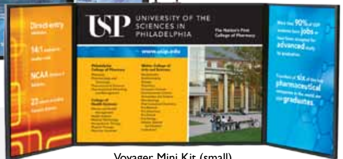
Voyager Mini Kit (small) open dimensions: 18" h x 48" w closed dimensions: 18" h x 24" h