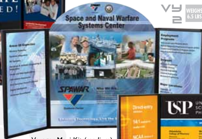
Voyager Maxi Kit (medium) open dimensions: 24" h x 48" w closed dimensions: 24" h x 24" w