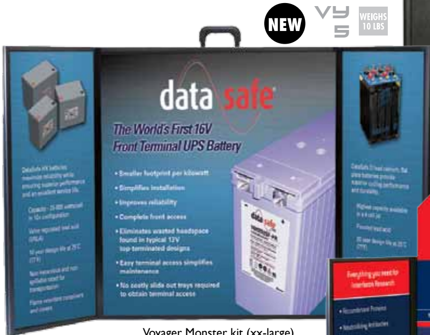
Voyager Monster kit (xx-large) open dimensions: 32”h x 64”w closed dimensions: 32”h x 32”w

All Voyager systems have a limited Lifetime Warranty. Internal graphics can remain on the Voyager during transport. Header options should be removed for transport and storage.