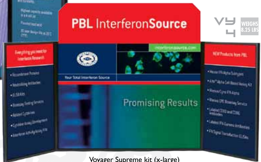
Voyager Supreme kit (x-large) open dimensions: 24”h x 64”w closed dimensions: 24”h x 32”w

Detachable graphics allow for easy changes! Extra graphics can be stored in the display case and packed away for easy storage.