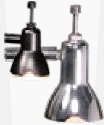
LUMINA 1 silk black: LUM-1-B chrome: LUM-1-C