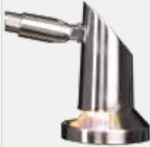
LUMINA 2 LUM-2