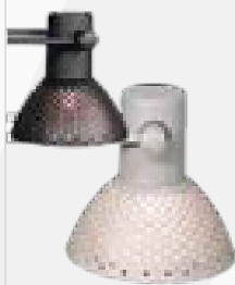
LUMINA 8 silk black: LUM-8-B painted silver: LUM-8-C