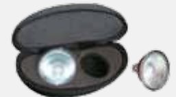
LUMINA SPARE BULB KIT LUM-BULB