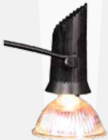
LUMINA 6 LUM-6