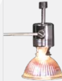
LUMINA 4 LUM-4