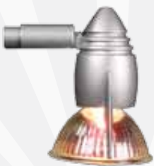
LUMINA 11 LUM-11