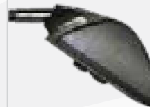
LUMINA 200 LUM-200 ORL