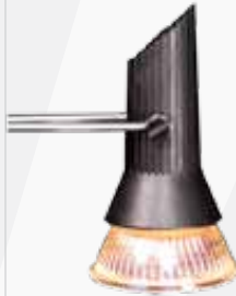
LUMINA 3 LUM-3