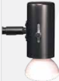
LUMINA 7 LUM-7