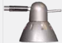
LUMINA 10 LUM-10